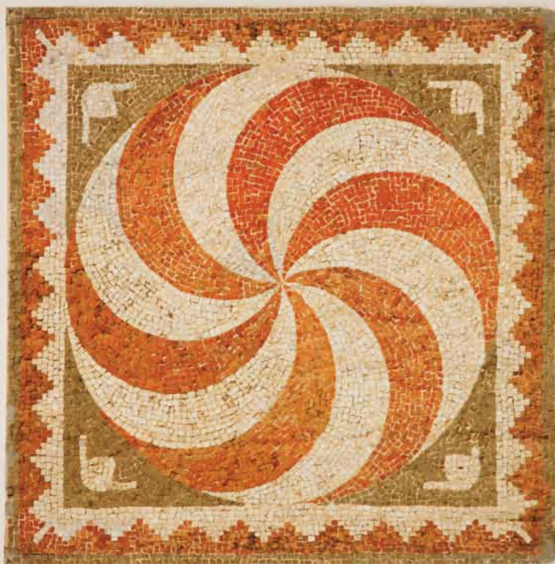
Mozaiiku i Tiranës, shek. III A.D.