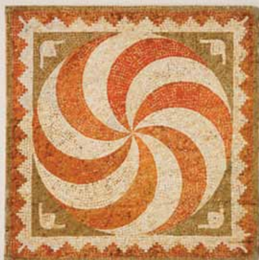
Mozaku i Tiranës, shek. III A.D.