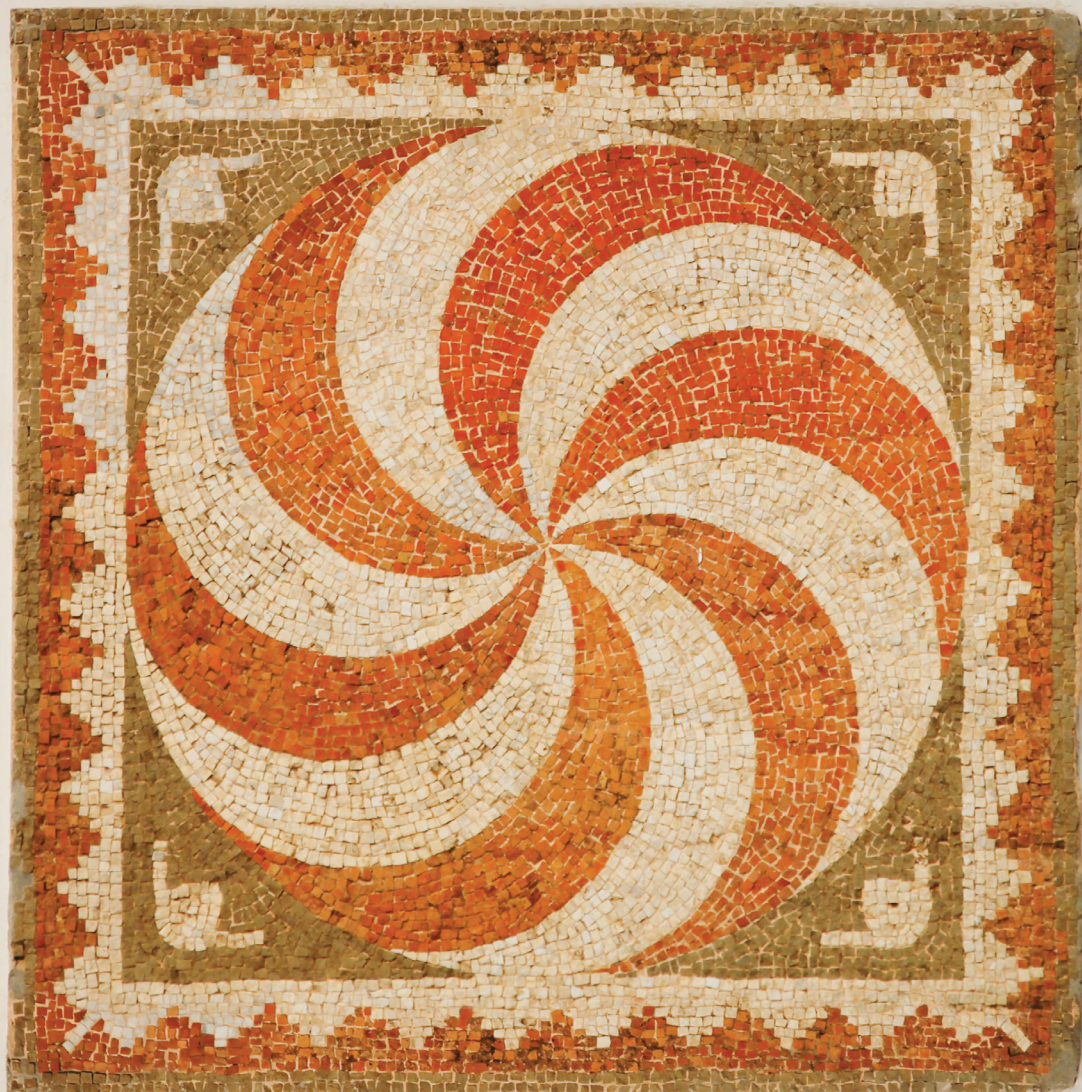
Mozaiiku i Tiranës, shek. III A.D.