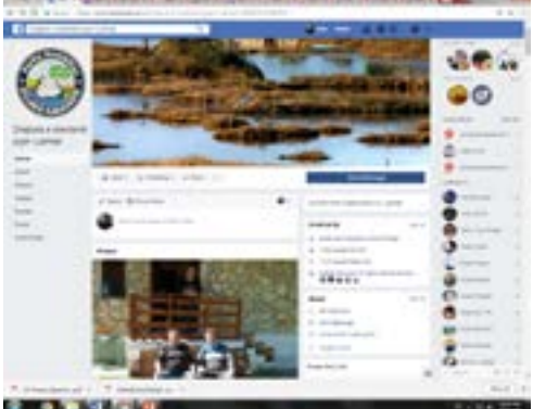
FIGURE 6: Left Drejtoria e shërbimit Pyjor, Fier (created 2013); Right RAPA of Fier (created 2015)