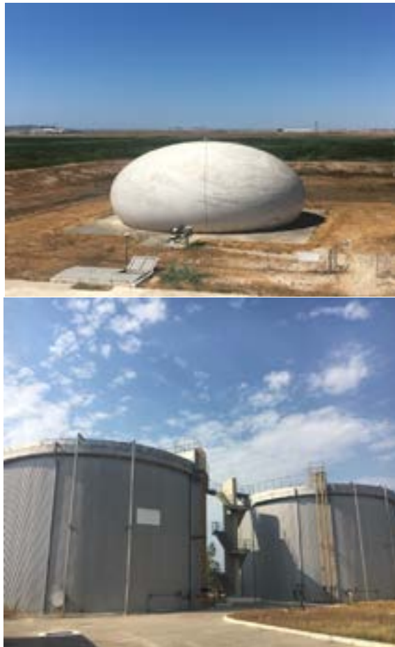
Figure 1 Biogas-holder and Anaerobic Digestion tanks in WWTPD

WWTP of Durrës has two anaerobic digestion tanks, but in the three years of study only one of the digester tanks has worked. The process used in digester is single-stage mesophilic continuous system. The biogas is collected from the anaerobic digestion and accumulated in the gas-holder tank to feed the boiler and the co-generation unit which is then transformed to power its own energy grid.