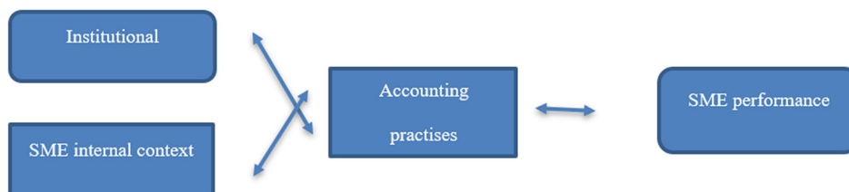
FIGURE 1. Institutional theory framework: Accounting and SME performance

Source: Burden theory Balzano, Marzi, & Turzo