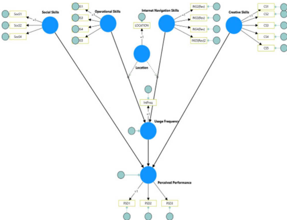
FIGURE 1. Output model