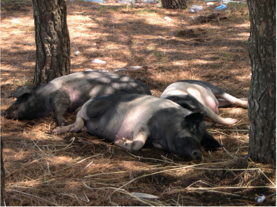
FIG. 5 – Sleeping porks