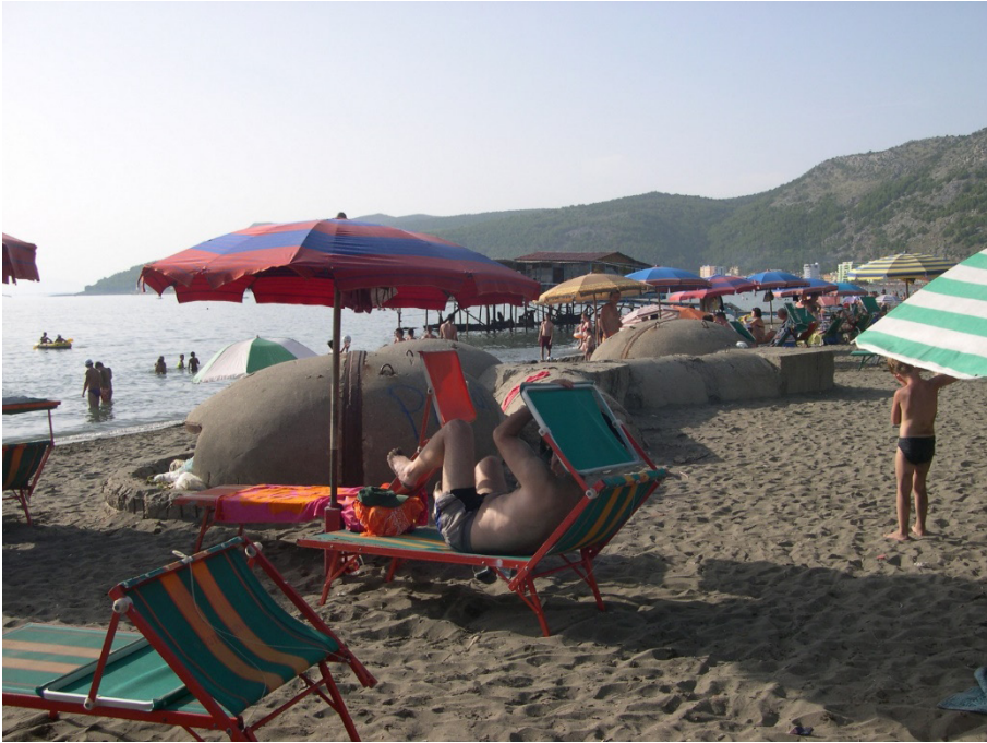
FIG. 7 - The past weighs too much