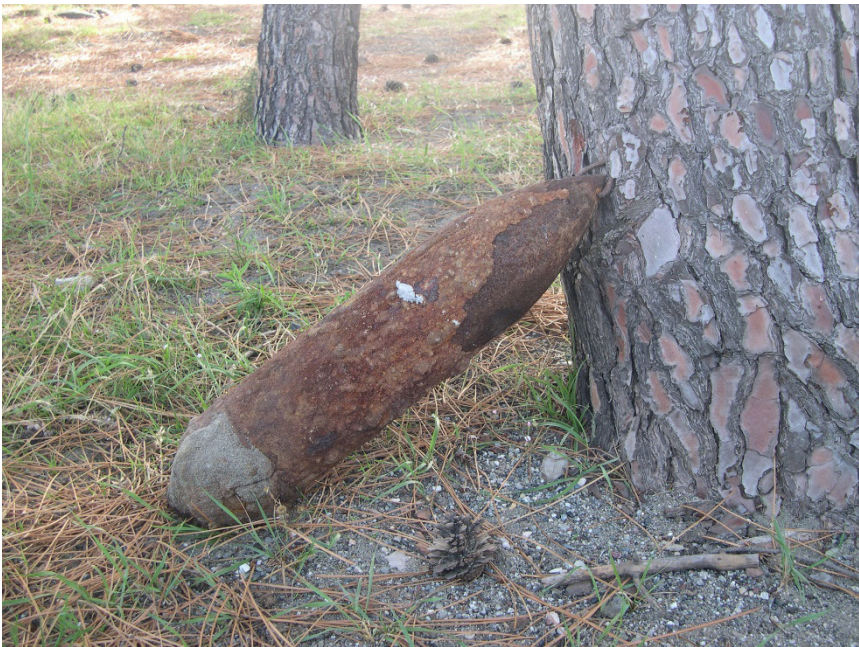
FIG. 6 – Sleeping weapon