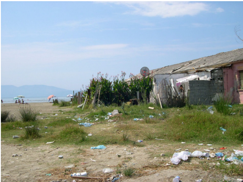
FIG. 4 . Huts in Velipoja