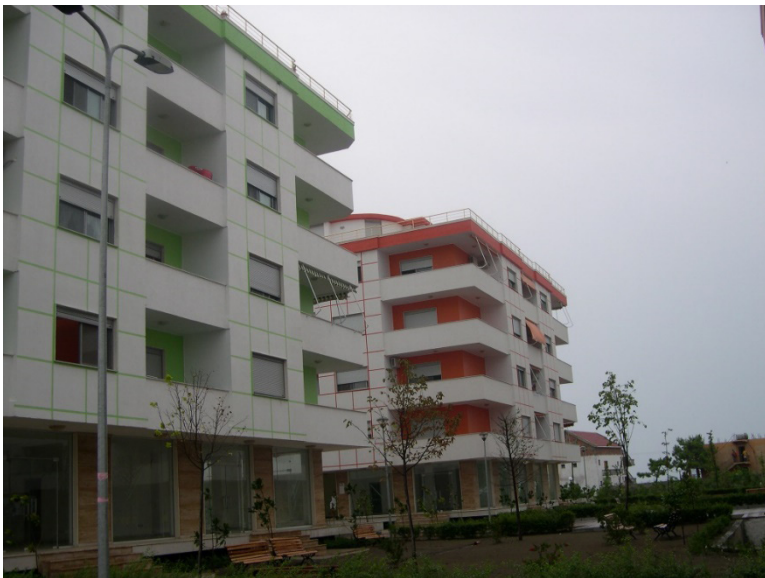
FIG. 8 - The passage to the "new" at the beginnings of this new century