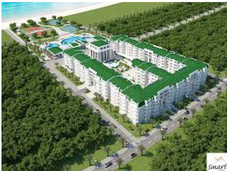
FIG. 9 – Luxury hotel in Velipoja