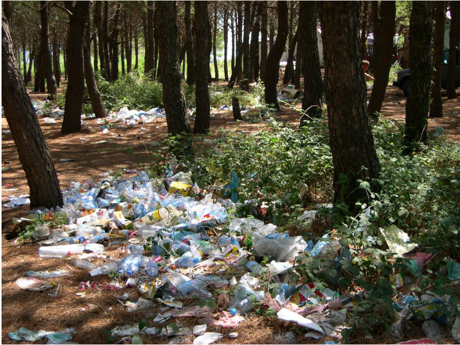
FIG. 3 - Velipoja: the state of abandonment of the forest in the back front of beaches