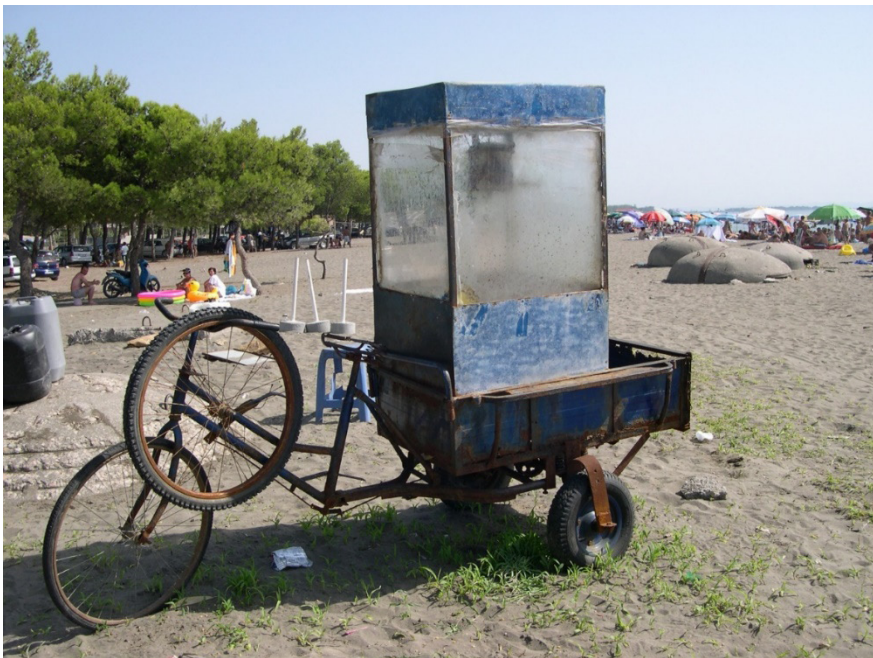
FIG. 2 – An elementary implementation of private services, like it is suggested by OECD, to start a free economy.