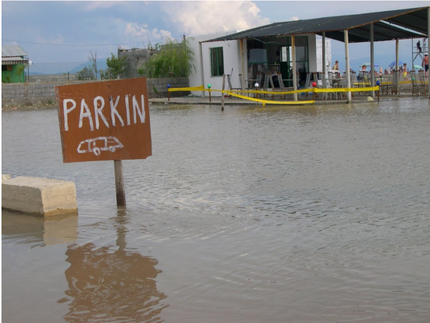
FIG. 1 – The first services offered twenty years ago in Velipoja