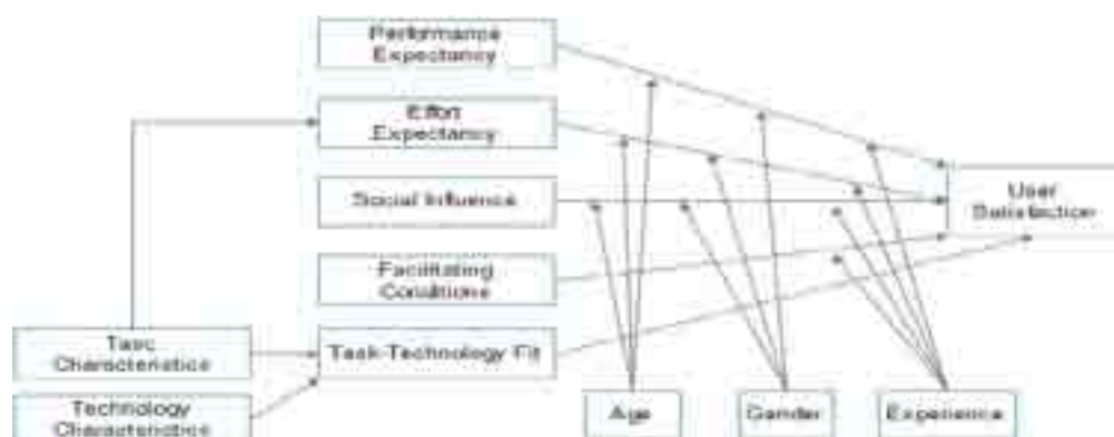
FIGURE 2: Research model of Mandatory E-government Digital Notarial