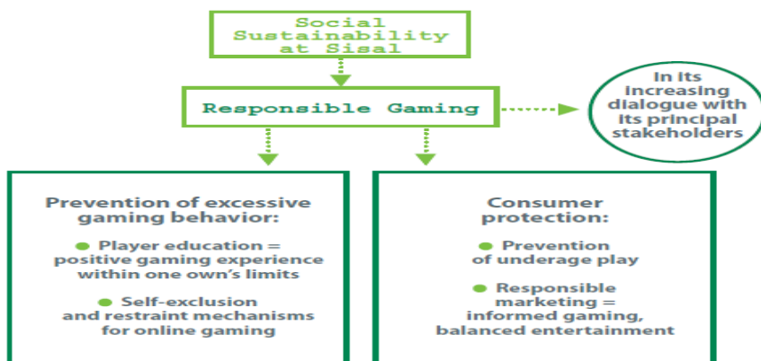
TABLE 5- Social Report 2011 Accountability and stakeholder engagement

Thus, those we have named “myths” are highlighted: accountability advances a relational improvement within the economic system, between companies, and especially the presence of relational tourism towards a non-generic, but specific, common good where all “poverties” are eliminated.